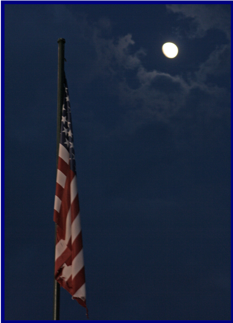
for this beautiful and patriotic shot.